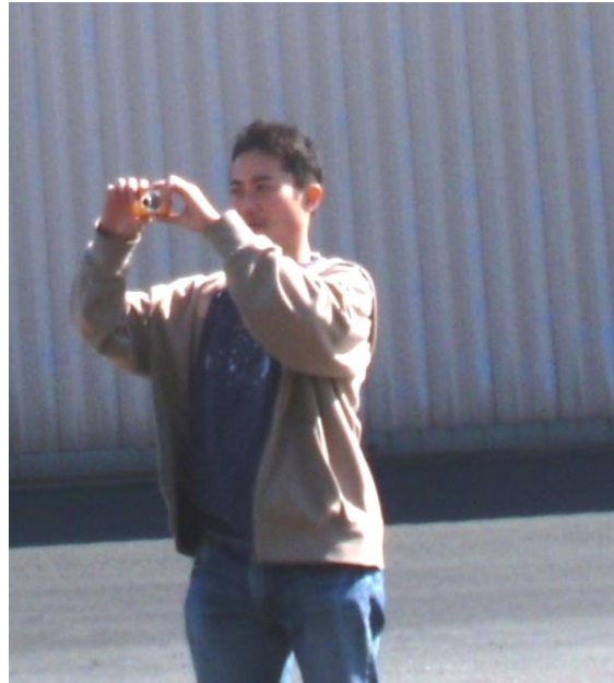
We got to the airport and instantly the camera came out.