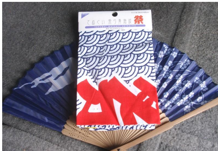
He presented me with a hand towel and a decorative fan. The big red character means festival